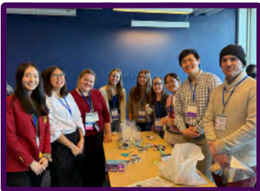
DCON Service Project - Packing 1,200 care packages for senior citizens!

Together, we make up ONE family, united by service, leadership, and fellowship!