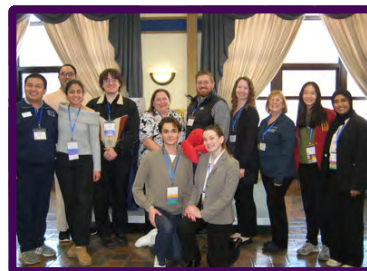
Kiwanis Family - Celebrating DCON with our Sponsoring Kiwanis Club!